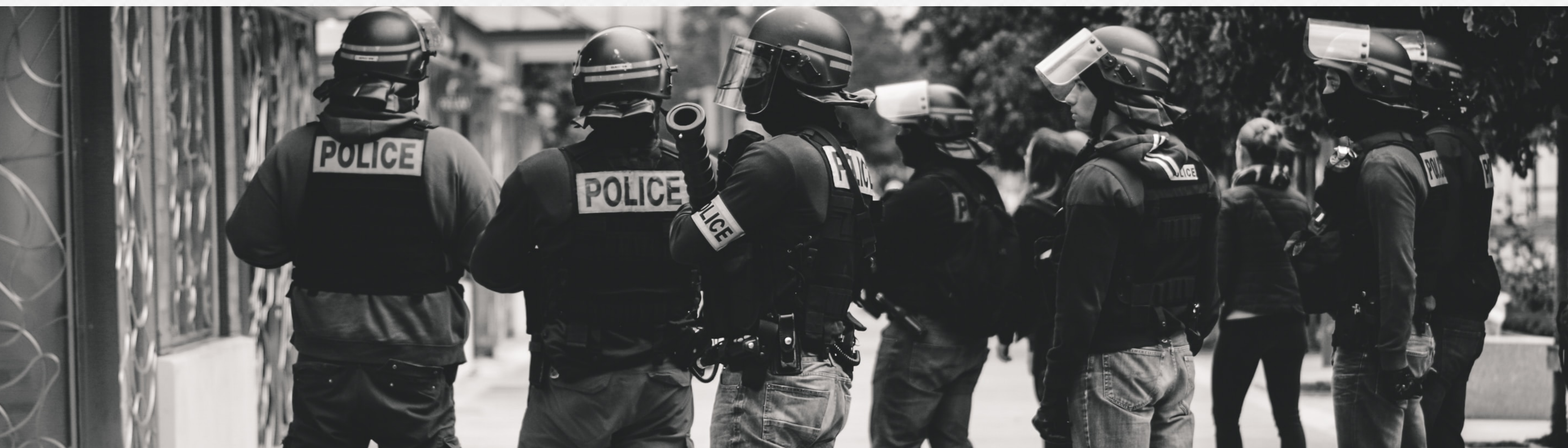
A black-and-white image of police officers wielding guns and wearing protective helmets and vests.

Weapons of war should not be used in the streets of the United States. But let's be clear: they shouldn't be used in Sanaa or Kabul either. Militarism abroad and militarism at home are two sides of the same deadly system — and rarely is that clearer than in the 1033 program.