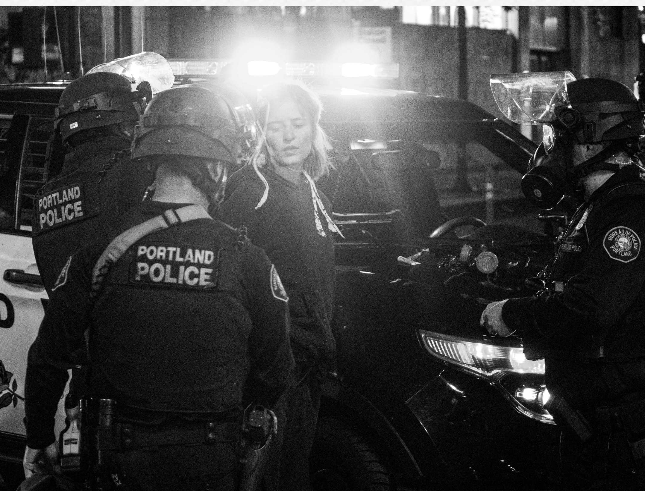
A black-and-white picture of a person being escorted into a police car by the Portland Police.

The Department of Defense does not provide training for recipients of the 1033 Program — agencies are left to certify their own training with little to no oversight. The requirement and incentive to use the transferred equipment encourages warlike policing. This further reinforces the "us vs. them" mentality that is responsible for such devastation around the globe. A lack of instruction exacerbates these issues by imbuing officers with the confidence to use deadly weapons without training.