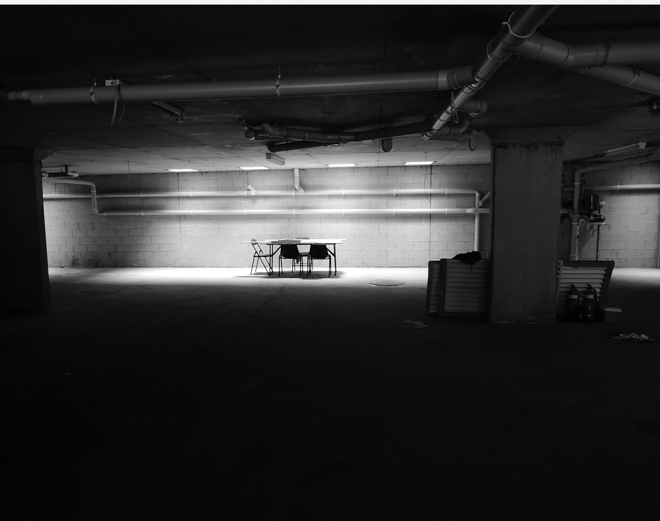
A black-and-white picture of an empty parking garage, with a single table and chairs under a bright light.

A made-up, non-existent “law enforcement agency” received $1,200,000 worth of military gear from the 1033 Program. In 2017, the U.S. Government Accountability Office (GAO) created a fictitious law enforcement agency — featuring a fake website and an address that traced back to an empty parking lot — and obtained $1.2 million worth of military gear, including night-vision goggles, simulated M-16A2 rifles, and bomb-making materials.