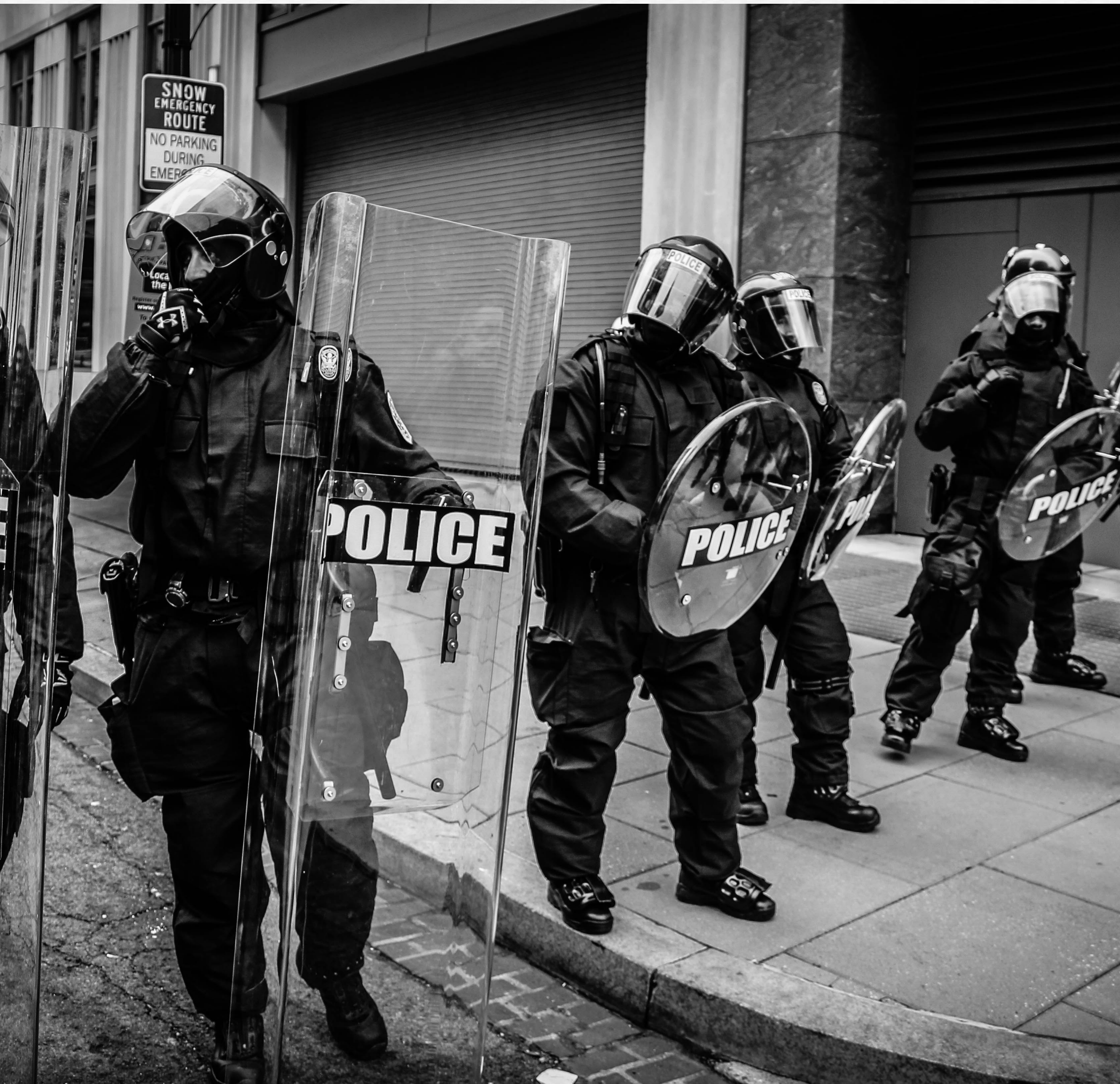
A black-and-white picture of police officers wearing "riot gear" - large shields, full-body protection, and large helmets.

The 1033 Program transfers the military's extra or outdated weapons and equipment to state and local authorities, as well as Customs and Border Protection (CBP) , — just for the cost of shipping. This includes armored vehicles, assault rifles, grenades, and Mine-Resistant Ambush Protected vehicles (MRAPs), all coming out of the Pentagon's over-inflated budget. As if pushing these weapons into our communities is not bad enough, the program contracts typically require that the equipment must be used within one year of receipt or else it must be returned to the federal government.